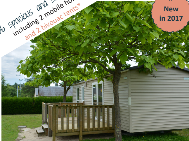
Pets are welcome.